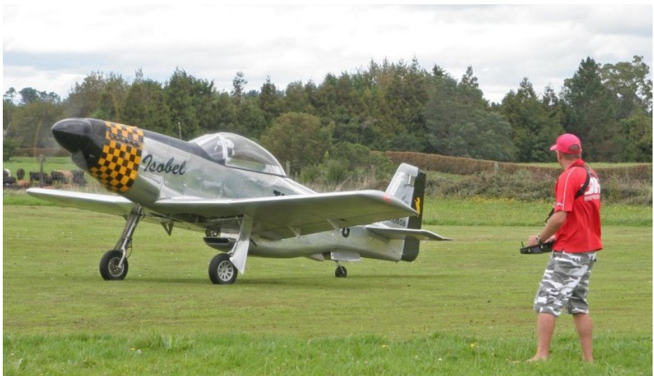
Frazer wishing the bind had worked!