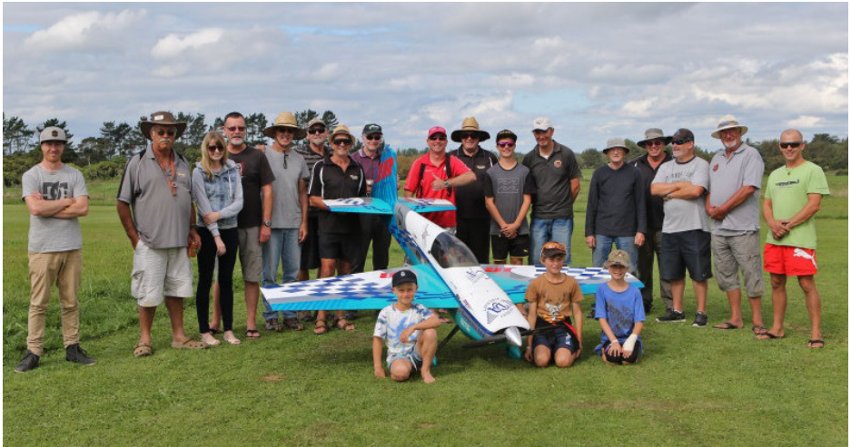
Pilots and pit crew with Frazer's big Aerobatic display model